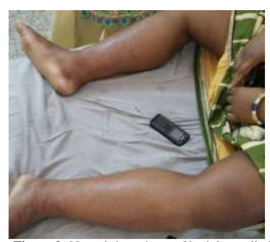
Figure 2: Non-pitting edema of both lower limbs